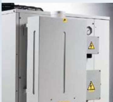
Atmospheric pressure fill kit

This kit (from 015) is simply installed onto the back of the chiller itself, and features a generous tank (with an easy to read water level indication) encased within a tough painted galvanized steel cabinet. A tap offers easy chiller water tank filling. The fill kit is standard on models M03-10.