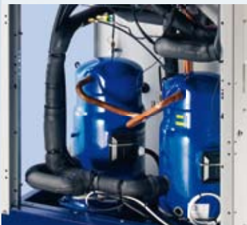
Easy frontal access

TAE evo always operates in all conditions, thanks to an internal trace water by-pass, phase monitor, generous water temperature limits, a 46 °C ambient temperature limit, antifreeze protection and an internal water level sensor. The advanced microprocessor ensures fail-safe operation at all times.