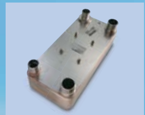
Stainless steel plate exchanger