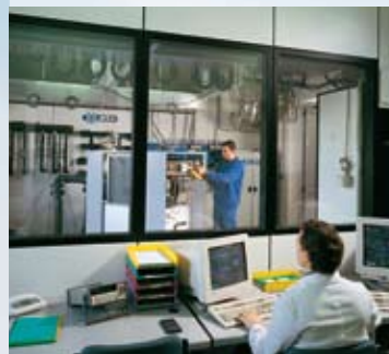
Extensively lab tested