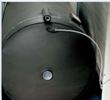
Large buffer tank