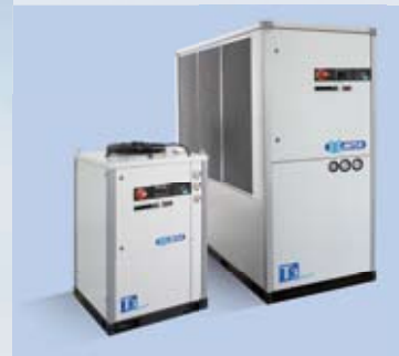
T3 Laser: designed for Laser applications

T3 Laser's PID controlled electronic hot gas valve (model 081-351) ensure extremely precise temperature control. A non-ferrous water circuit allows the use of demineralised water containing additives and protects the laser's source and optics from contamination. Specific brochure available.