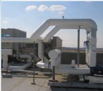
Process cooling application

In many cases the chiller forms part of a complex hydraulic network. MTA offers expert consultancy born from extensive field experience in countless applications, allowing Users to obtain the most from their chilled water network.