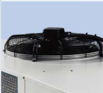
Robust fan section

The most popular solution, with an air-cooled condenser allowing quick and easy installation and high versatility in a multitude of applications. As per the rest of the range, the internal tank and pump offer a fully packaged solution.