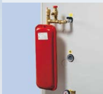
Pressurised fill kit

This kit, available from model 015, is used in pressurised water circuit applications (up to 6bar). The kit features all components required for safe and easy operation, including a pressure reducer, water inlet valve, pressure gauge, automatic relief valve, safety valve and expansion tank.