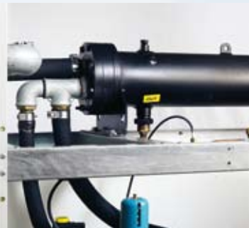
Shell & tube condenser

Water-cooled models offer elevated energy efficiency (EER) levels, and are well suited to hot ambients, or those where indoor installation is required. Noise levels are also reduced notably. Specific brochure available.