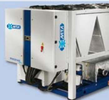
Phoenix Plus chiller

MTA offers industrial air and water-cooled chillers up to 1500kW, with multiscroll, piston or screw compressors. Freecooling units, ideal for industrial applications, are also available. Specific brochure available.